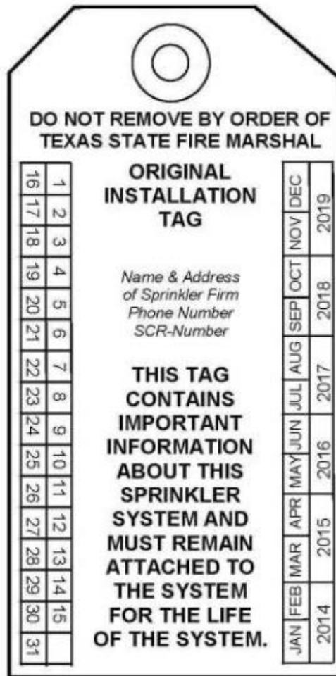
Figure 28: TAC §34.718(h)