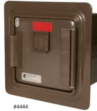
#4444 Single Lock, Recess Mount

Knox Vault 4400 Series for Up to 35 Keys